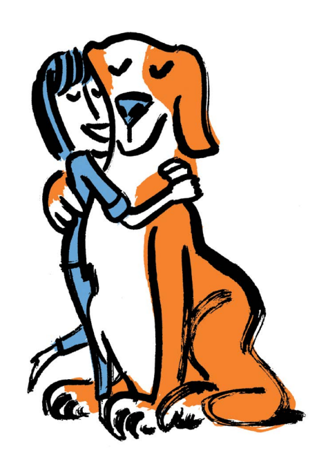
At Aspiriant, we strive to institutionalize caring.